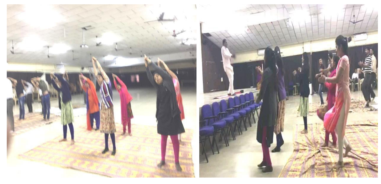
During Art of Living Session

A Vidyabharti Trust Institution Vidyabharti Campus, At. Ta. Bardoli, Dist. Surat-394345 Ph.02622-224581, 220581 Fax: 02622-227481,225458 Email: admin@snpitrc.ac.in, vbtdegree_umrakh@yahoo.co.in Vicit us on: www.snpitrc.ac.in