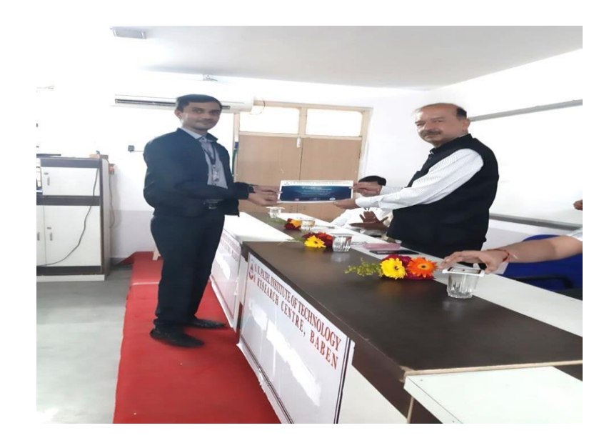
Certificate Distribution during Valedictory

A Vidyabharti Trust Institution Vidyabharti Campus, At. Ta. Bardoli, Dist. Surat-394345 Ph.02622-224581, 220581 Fax: 02622-227481,225458 Email: admin@snpitrc.ac.in, vbtdegree_umrakh@yahoo.co.in Vicit us on: www.snpitrc.ac.in