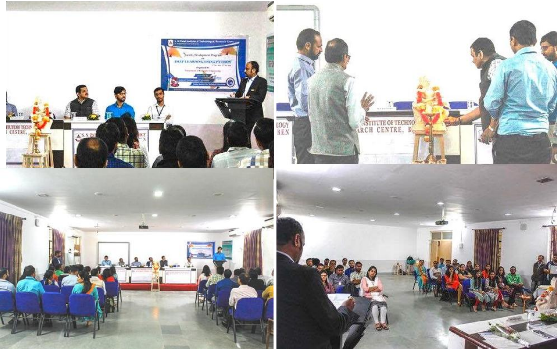
Formal inauguration of program